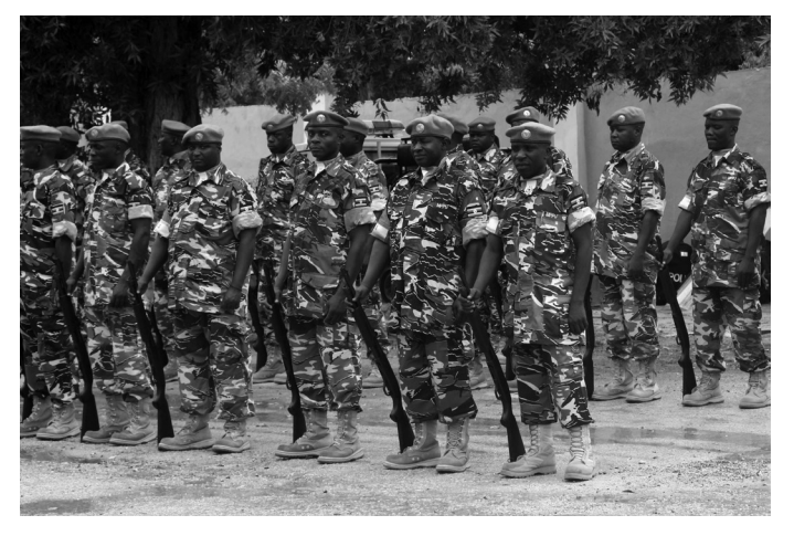
Figure 6. Police Units of the African Union Mission in Somalia (AMISOM) stand in position after concluding training in the Somali capital Mogadishu.

Perhaps the area with the greatest potential for AMISOM disunity is the rich prize of Kismayo and its