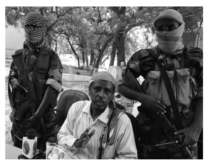
Figure 5. Leader of al-Shabaab in Mogadishu Sheikh Ali Mohamed Hussein.

al-Shabaab, there has been a separate current of clan violence. Clashes in the central region of the country between clans competing for land and water killed 26 people,<sup>358</sup> and IDPs from minority or otherwise despised clans are being abused in IP camps at the hands of Somalis from other clans.359